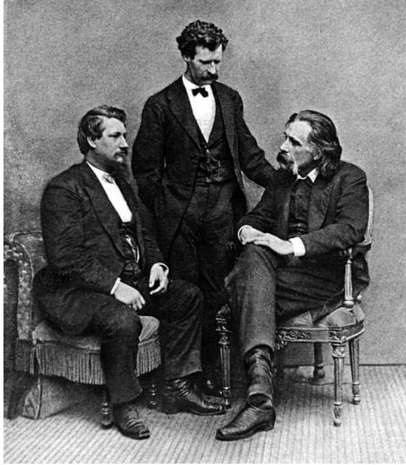
Petroleum V. Nasby, Mark Twain, and Josh Billings